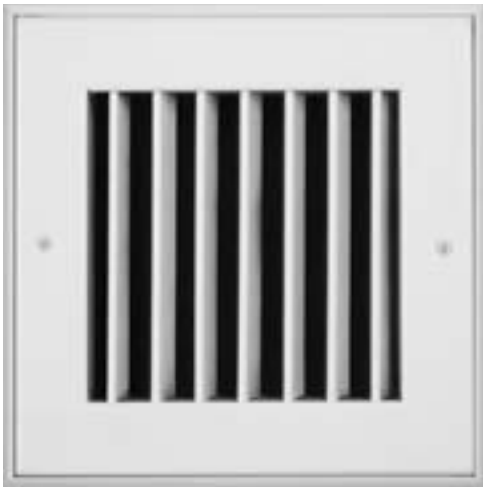
Single deflection supply grille shown with RC frame