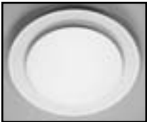
For plaque style (model CM-1P) see Architectural Section page B-19