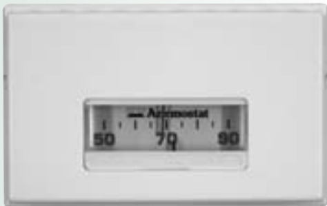
Cooling Only Wall Thermostat (Included When Applicable)