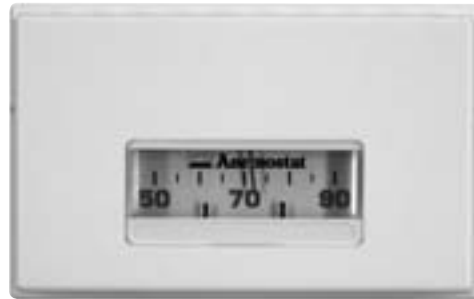
Heating & Cooling Wall Thermostat (Included When Applicable)