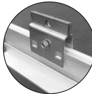
Clamp for Mating Half T-Beam Section