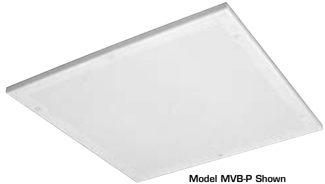
Model MVB-P Shown