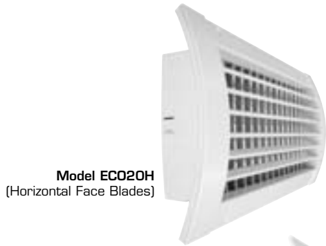
Model ECO20H (Horizontal Face Blades)