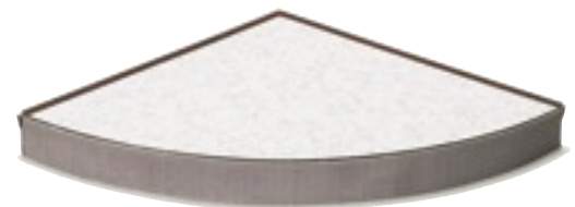
WOODCORE PANEL WITH HPL LAMINATE & VINYL EDGE (computer room applications - factory applied conductive and dissipative finishes available)