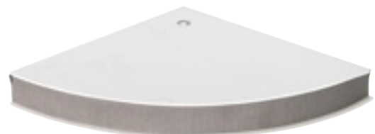
WOODCORE PANEL WITH BARE METAL SURFACE & CORNER-BOLT OPTION (carpet tile application)