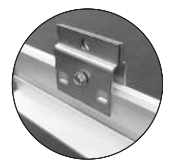
Clamp for Mating Half T-Beam Section