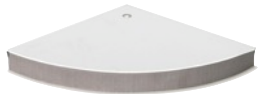
SC PANEL WITH BARE METAL SURFACE & CORNER-BOLT OPTION (carpet tile application)