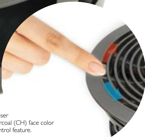
RFSD Swirl Diffuser shown with Charcoal (CH) face color and personal control feature.