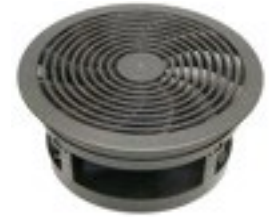
PERSONAL AIR FLOW CONTROL