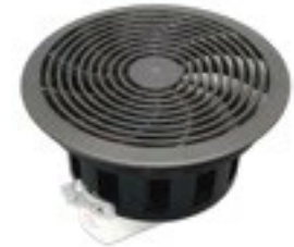
WITH SIEMENS 24VAC ACTUATOR CONTROL