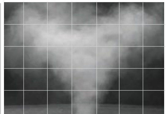
TYPICAL AIR FLOW TEST

106cm 106cm 3.5' 2.5' 1.5' .5' .5' 1.5' 2.5' 3.5'