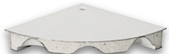
FS PANEL WITH BARE METAL SURFACE & CORNER-BOLT OPTION (bare finish for carpet tile application)