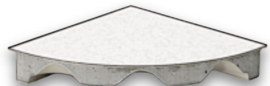
FS PANEL WITH HPL LAMINATE & IT EDGE OPTION (computer room applications - factory applied conductive and dissipative finishes available)

see understructure data sheet for pedestal head, base and stringer options